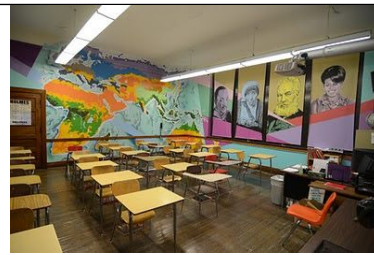
20 th Century Classroom