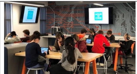
21 st Century Classroom