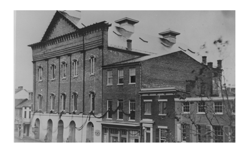
Virtual Visit: Ford's Theatre