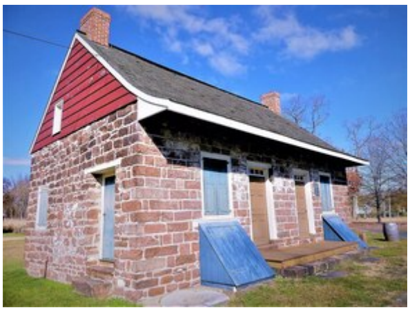
My Story Documentary Video Visit our 30 stories from 13 NJ counties

My memory is failing me from hunger as I am held prisoner in the Sugar Prison on Liberty Street in New York City. My father visited me four times this week insisting that I should swear an Oath of Loyalty to the king to secure my release and save my young life. I believe in the Declaration of Independence but our army is losing every battle. Help me with my painful decision.