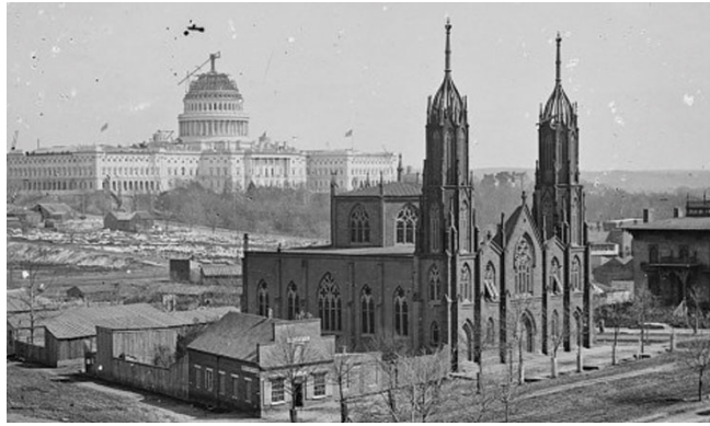
Exploring Lincoln in Washington

Look inside Ford's Theatre National Historic Site. Using high-quality photographs, this interactive program will show participants inside Ford's Theatre and the presidential box, inside Petersen House and the room where President Lincoln died; and select artifacts from the Ford's Theatre museum.